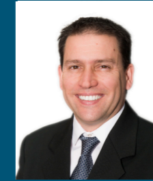
Mayor Matt Burnett