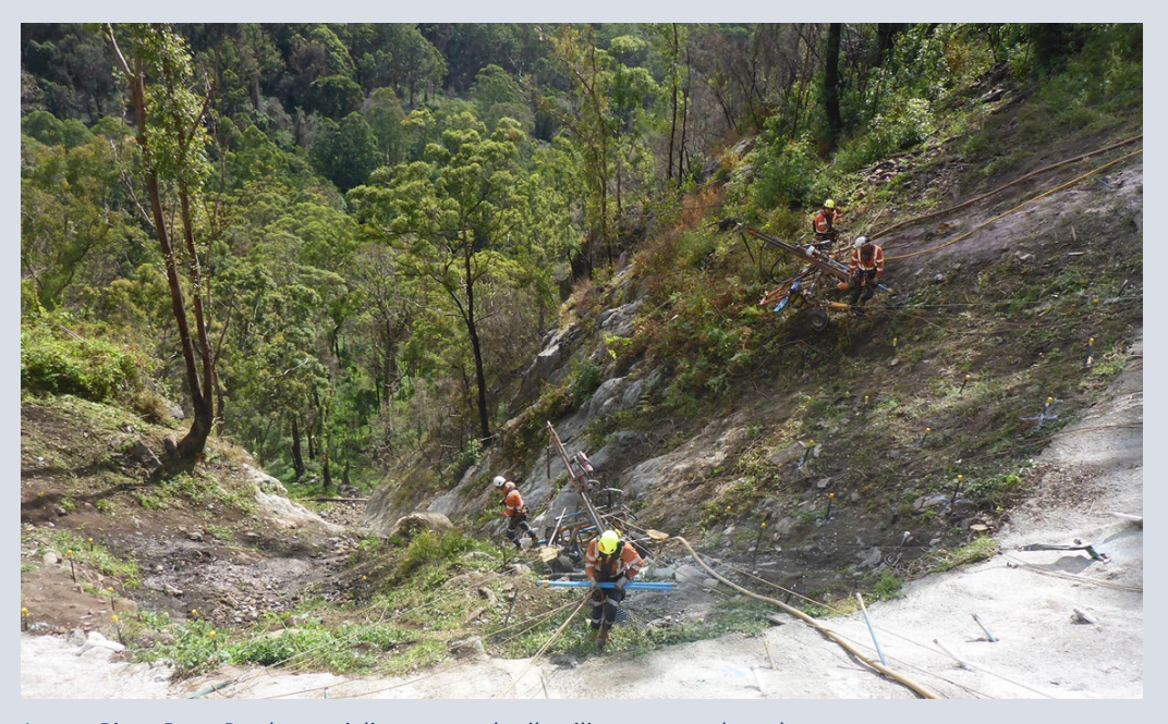
Image: Binna Burra Road – specialist personnel soil-nailing on steep downslope.

Pavement rehabilitation is funded through the Queensland Transport Roads Investment Program (QTRIP) . Eligible reconstruction works are jointly funded by the Commonwealth and Queensland governments under the Disaster Recovery Funding Arrangements (DRFA) .